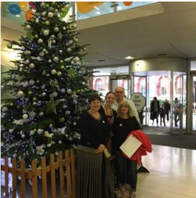
FHS staff delivering the books and gifts to the hospital.

Thank you so much for delivering presents to children at Evelina London Children's Hospital this Christmas. Many of our long term outpatients have already been given a little extra gift at their appointments this week and we are so excited to be able to surprise patients on Christmas day with a special pillowcase full of presents!