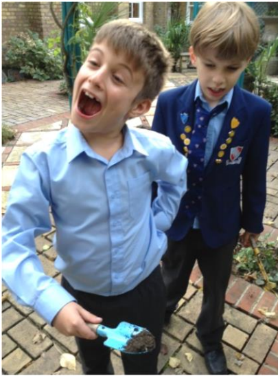
Branson Class's Wormery