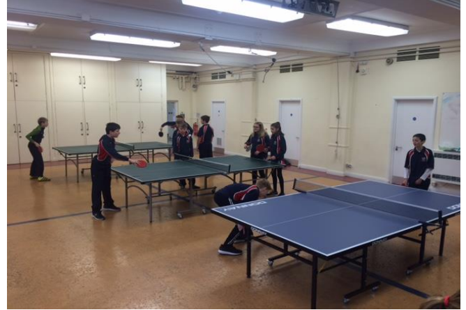
Table Tennis has been growing immensely as a sport of choice for many students at Causton Street, playing table tennis every day of the week during the morning break. The numbers are rising and we now have 3 tables and the level is increasing. Students can work on their body co-ordination, agility, self awareness and on their racket skills. Wonderful progress from all the students involved!