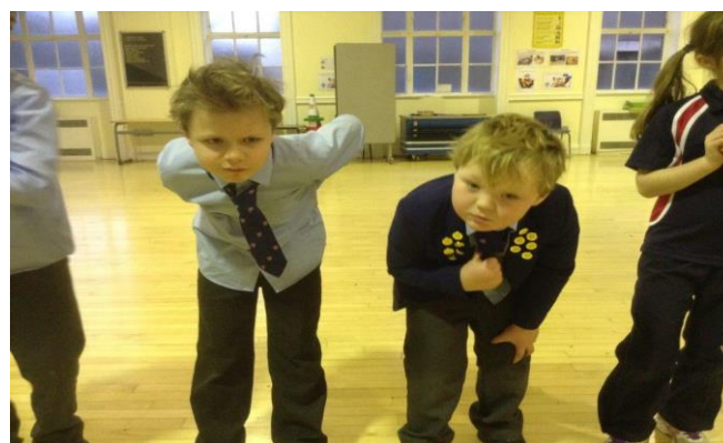
Grumpy orphans from Annie