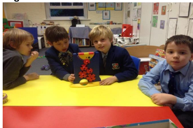
Peer tutoring, showing the group how to play Downfall.